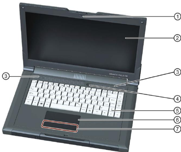
Front view with display open