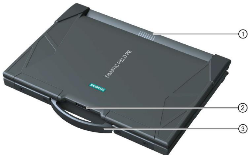
View with closed display